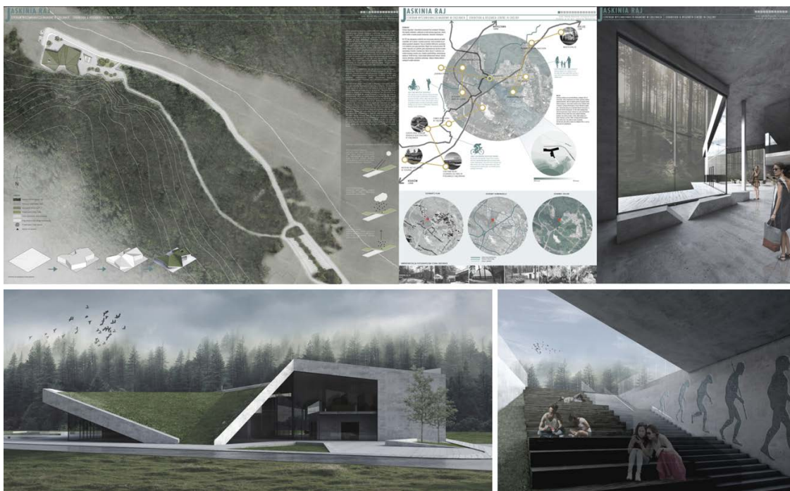
Figure 2: Student Mikołaj Wiczorek, Jaskinia Raj (the Paradise Cave), Chęciny near Kielce (Poland). Distinction in the competition for the best diploma project in 2017, organised by the Kielce Technological Park; distinction of the examination committee/engineering diploma, 2017.

The second project combines a single space that unites architecture and landscape, modernity and history with minimal interference to the existing assets of the natural landscape. An exhibition and scientific facility was set up in the middle of the forest, surrounded by the exceptional assets of the Raj Cave nature reserve within the range of the Świętokrzyskie